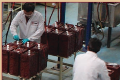
Product Life Testing

Since Trojan Battery built its first battery in 1925, we have been the world's undisputed leader of deep cycle battery technology. Trojan batteries are unmatched by any competitor products in life, durability and capacity while providing dependable power to any golf, renewable energy, floor machine, aerial work platform, marine or recreational vehicle application. Currently in its third generation of family leadership, Trojan operates four advanced manufacturing facilities across the United States. Trojan's corporate headquarters and two of its manufacturing facilities are located in Southern California; Trojan's two East Coast facilities are located in Georgia. Trojan also has two of the largest and most extensive bi-coastal research & development centers dedicated to battery technology in North America, where we continue to focus on designing advanced and innovative products that are specifically engineered to meet key market requirements.