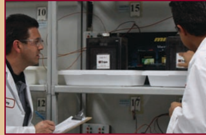
Rapid Prototype Evaluation